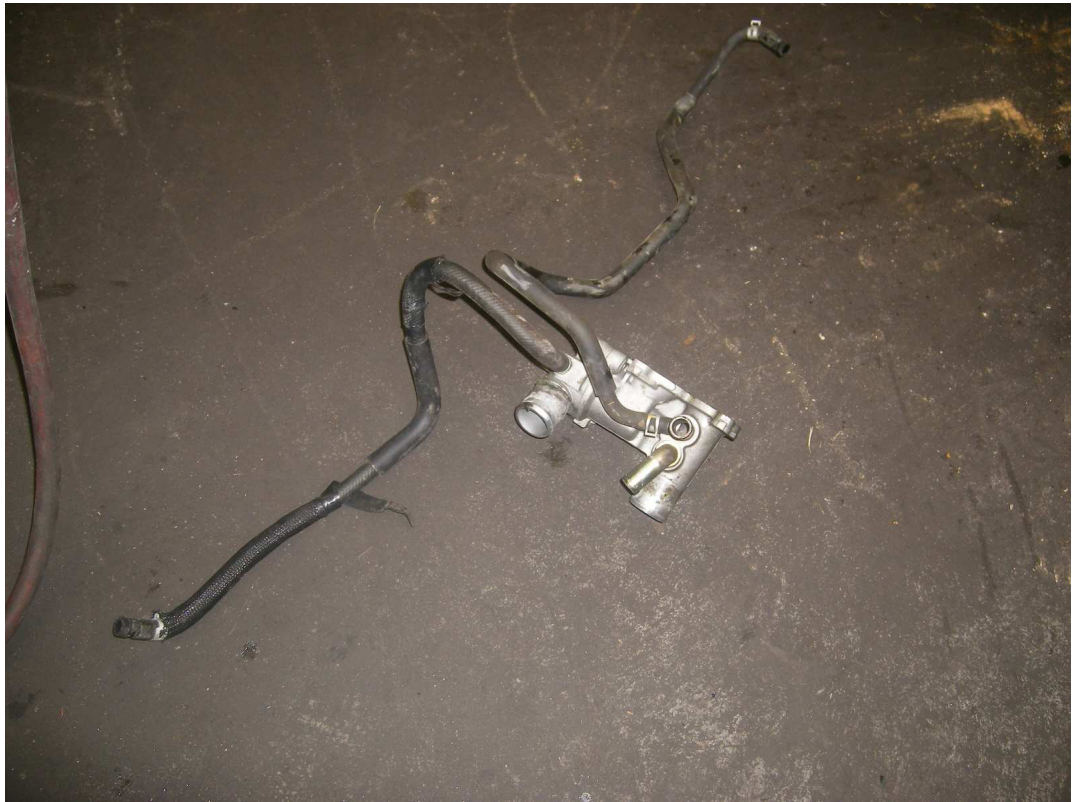
Top end is now stripped.