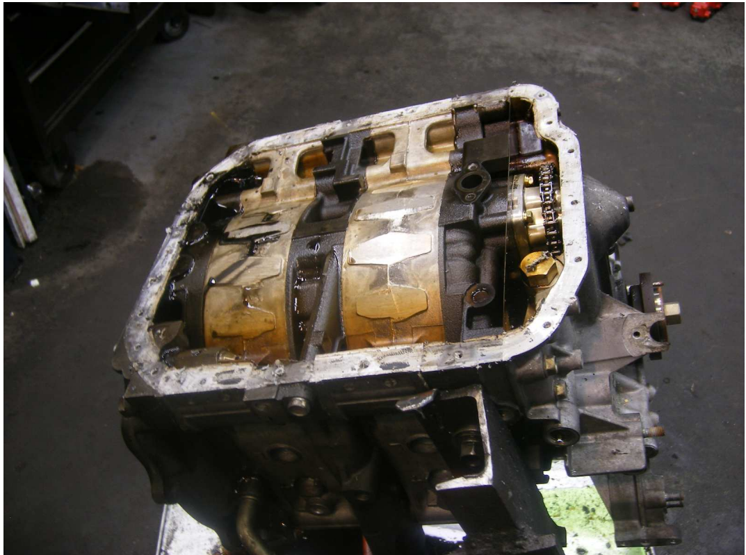
Engine is now stripped and ready to be disassembled or returned as a core.

Last edited by RotaryResurrection, 03-20-2014 at 09:31 PM