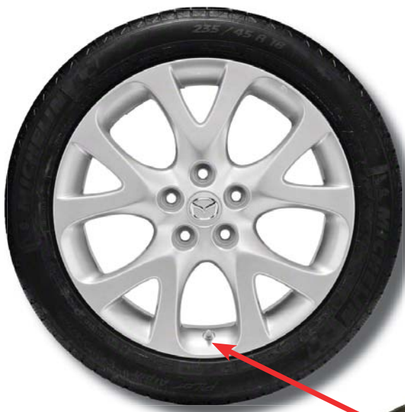
Genuine Mazda Wheel