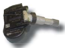
TPMS Wheel Sensor

Warranty Compliance Note: Installing missing TPMS wheel sensors and/or TPMS sensor ID registration may not be claimed under warranty.