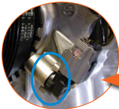
← OLD Design

When installing an engine into an RX-8, you may notice the mount for the eccentric shaft position sensor on the front cover is shaped differently. This new design is compatible with all current eccentric shaft position sensors installed on all 2004-2008 RX-8 vehicles. Also, 2006-2008 RX-8 vehicles produced from 4/1/2006 use this new front cover design. DO NOT replace the front cover.