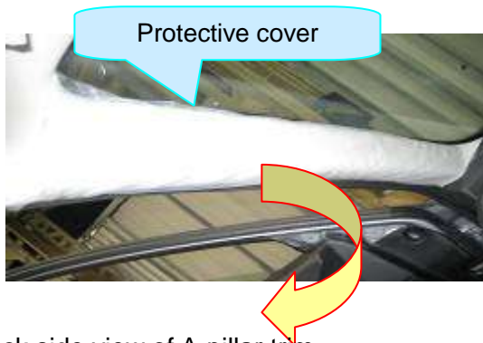
Back side view of A-pillar trim

To avoid this, please make sure to remove the protective cover according to the following procedure.